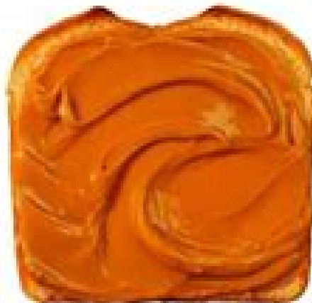
Peanut Butter on Toast