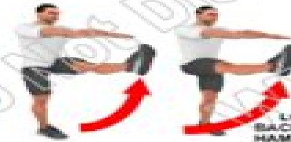
LOWER BACK, HIPS & HAMSTRINGS