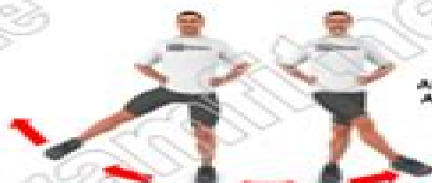
HIP ADDUCTORS, ABDUCTORS & GROIN