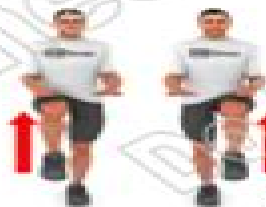
LOWER BACK, HIPS & HAMSTRINGS