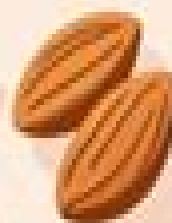
Rich in Omega-3