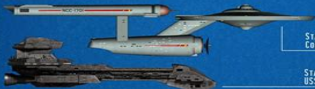
STAR TREK CONSTITUTION CLASS USS ENTERPRISE - 288 METERS