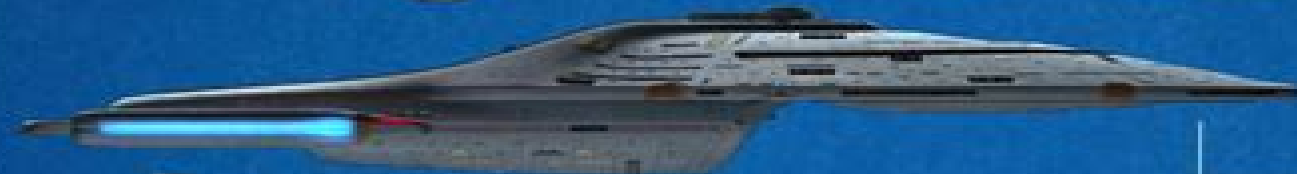
STAR TREK INTREPID CLASS - 344 METERS