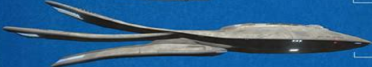
THE ORVILLE USS ORVILLE - 337 METERS