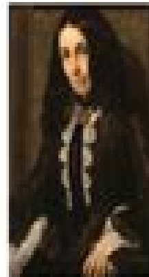
Elizabeth Barrett Browning