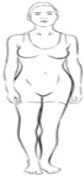
Average- or "Healthy"-weight