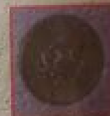
BACK OF BACK