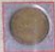
BACK OF BACK