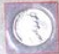
FRONT OF FRONT