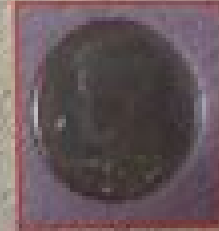
FRONT OF FRONT