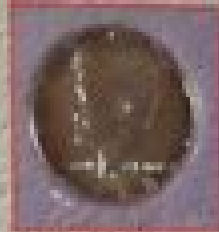
BACK OF BACK