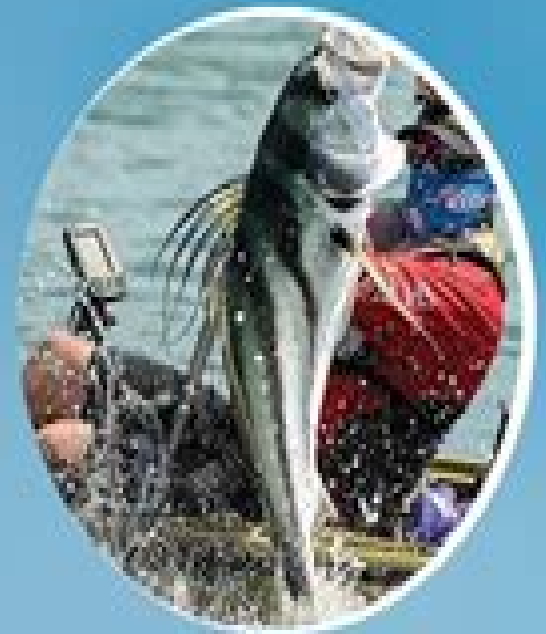
Positioning Accuracy big catch