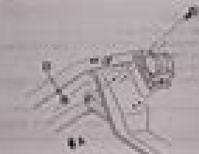
MODELS WITH BEAM AXLE (RPO P50)