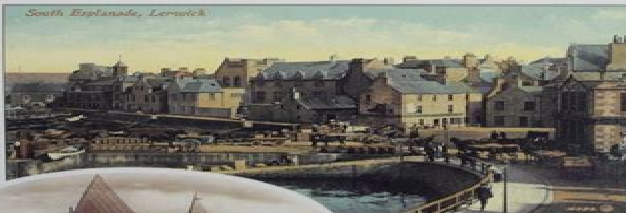
South Esplanade, Lerwick