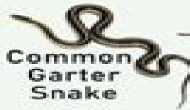
Common Garter Snake