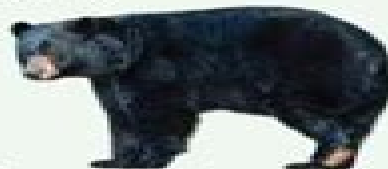
American Black Bear