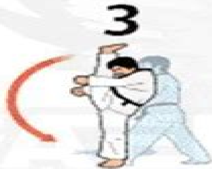
Drop/Axe Kick (Neryo-chagi) Frontal kick with an emphasis on the downward strike of the heel