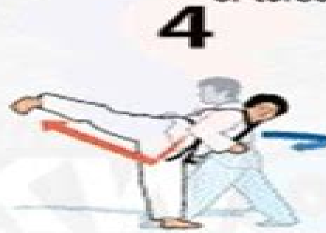
Back kick (Dui-chagi) Turn around kick, released when back is facing opponent