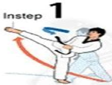
Roundhouse kick (Dollyo-chagi) Kick using instep of the foot, released while body is turning 45 degrees