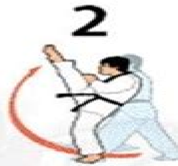
Front kick (Ahp-chagi) Direct frontal snap kick that targets the opponent's chin or torso