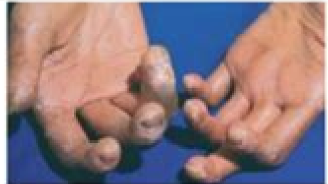
clawlike appearance , ulcerations