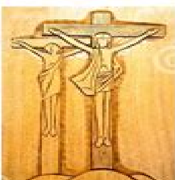
THE GOOD THIEF