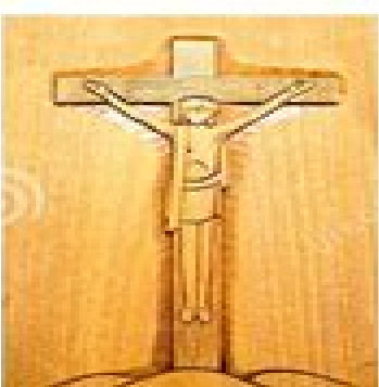
DIES ON THE CROSS