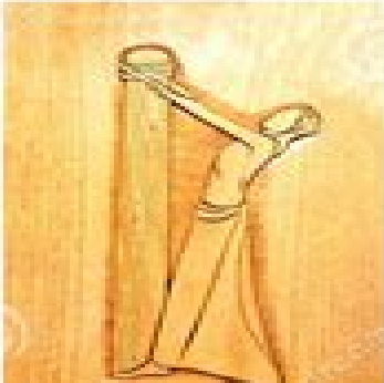
WHIPPED AND CROWNED