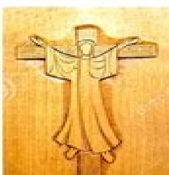
RISES FROM THE DEAD