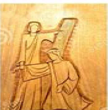
HELPED BY SIMON