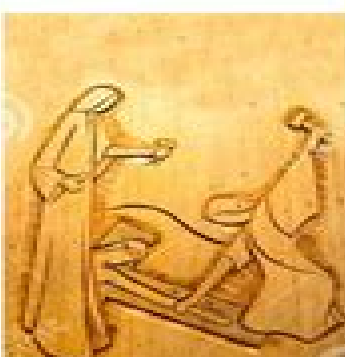
NAILED TO THE CROSS