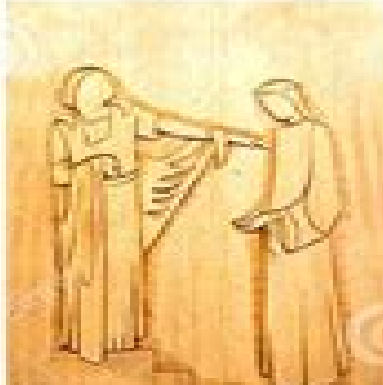
JESUS BEFORE PILATE