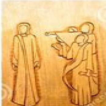
BEFORE THE SANHEDRON