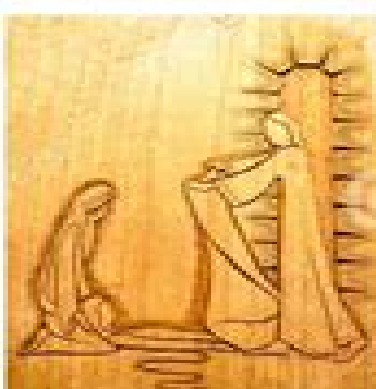
JESUS IS BURIED