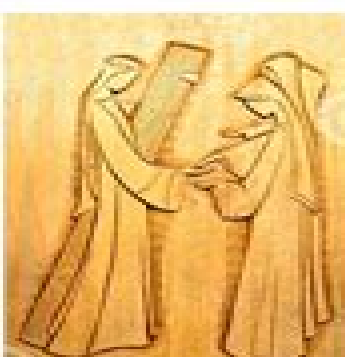
THE HOLY WOMEN