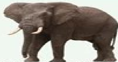
African Bush Elephant