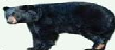
American Black Bear