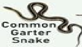
Common Garter Snake