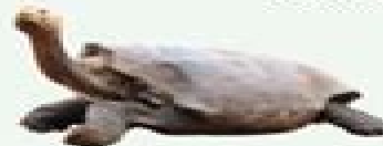
Galapagos Giant Tortoise