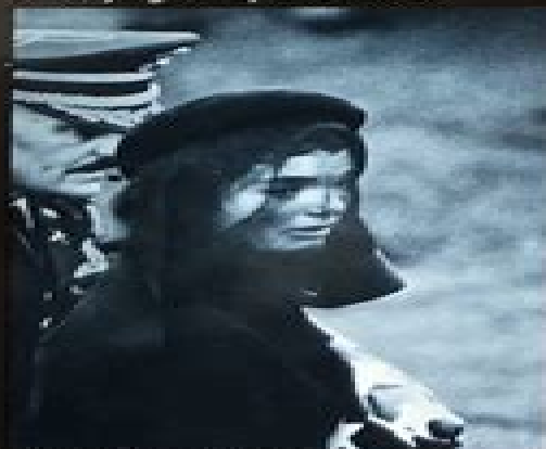
Reporting the news