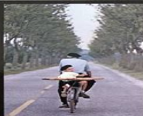
Traveling with a camera