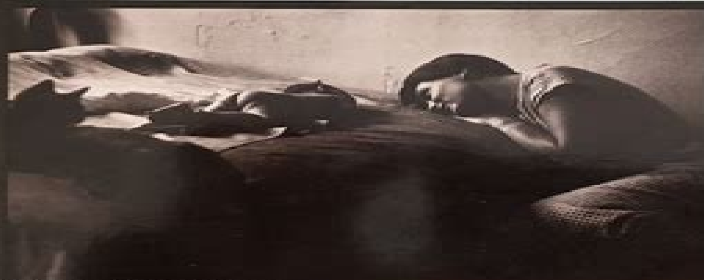
Portraying family and friends

PERSONAL INSIGHTS OF A PROFESSIONAL PHOTOGRAPHER ELLIOTT ERWITT