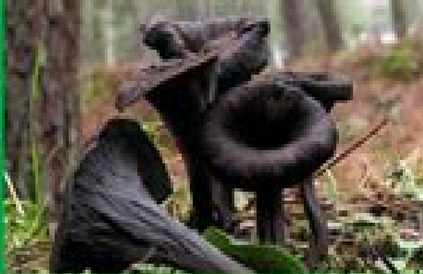
HORN OF PLENTY