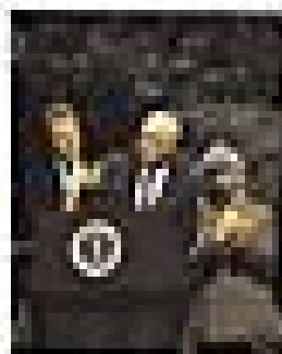
President Barack Obama and Vice President Joe Biden at a ceremony.

Each branch has its own powers and checks on the other branches. For example, the President can veto laws passed by Congress, but Congress can override a veto with a two-thirds majority. The Supreme Court can declare laws unconstitutional, but Congress can change the Court's composition.