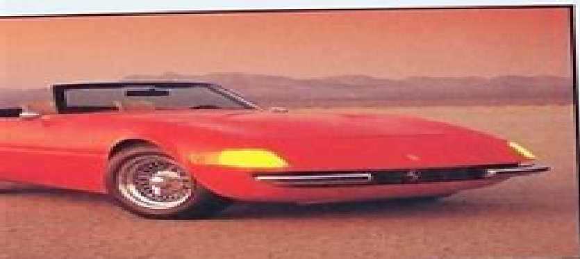
Ferrari 365 GTB/4 Daytona