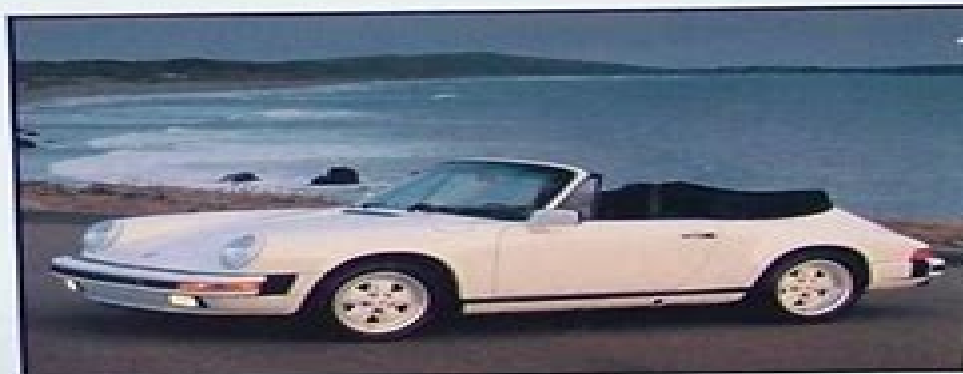
Porsche 911 Carrera