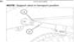
Figure 1: Attaching and detaching the attachment

1. Before starting the engine, make sure the parking brake is set and the loader is in the neutral position. The operator must be seated in the operator's seat and the seat belt must be fastened.