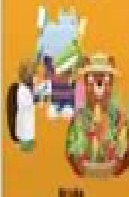
Illustration by [unintelligible]