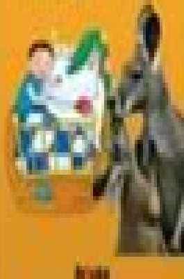
Illustration by [unintelligible]