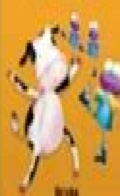
Illustration by [unintelligible]