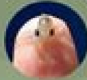
Smallest: Star-nucker pygmy octopus ( Octopus wotti ; 2.5 cm)