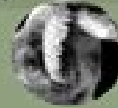
Smallest: Southern pygmy squid ( Idiosepius notodes ; 1-2 cm)