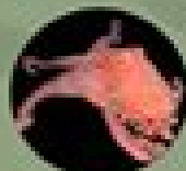
Largest: Giant Pacific octopus ( Euryteuthis jenkinsi ; 9 m)