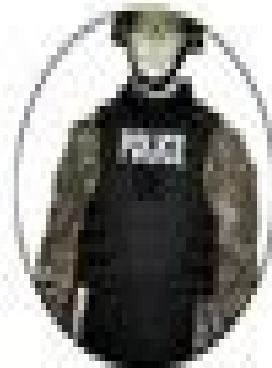
Bullet proof vest