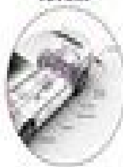
Vehicle fuel tanks