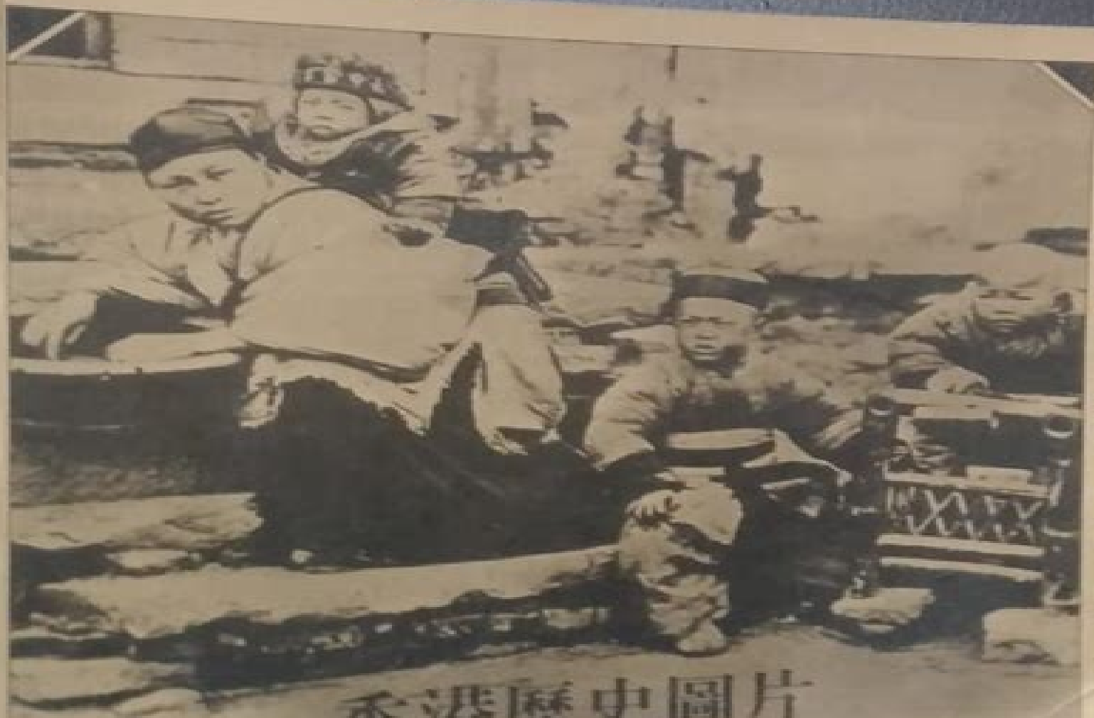
香港歷史圖片 The Hong Kong Album