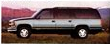
1500-2500 4x4 (2001) 16" steel