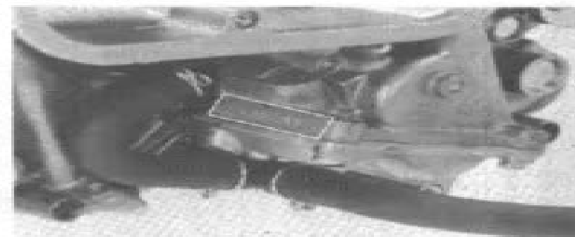
The carburetor identification number is on the carburetor body left side.