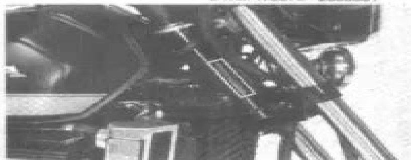
The frame serial number is stamped on the steering head right side.