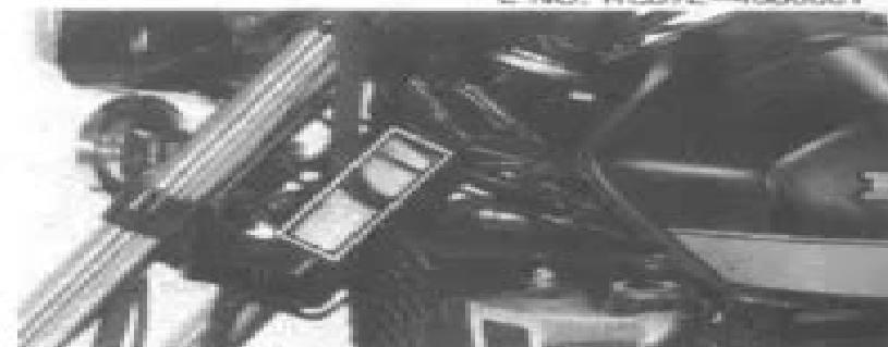
The vehicle identification number (VIN) is on the steering head left side.