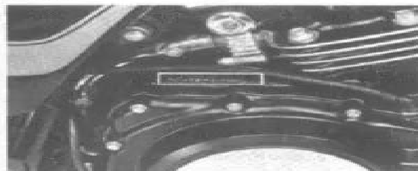
The engine serial number is stamped on top of the right crankcase.