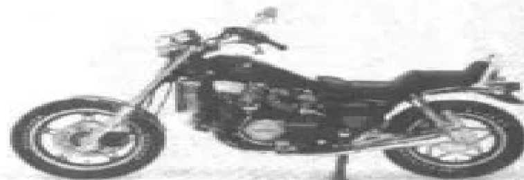
V45 MAGNA BEGINNING F NO. RC071 - CM000001 E NO. RC07E - 4000001