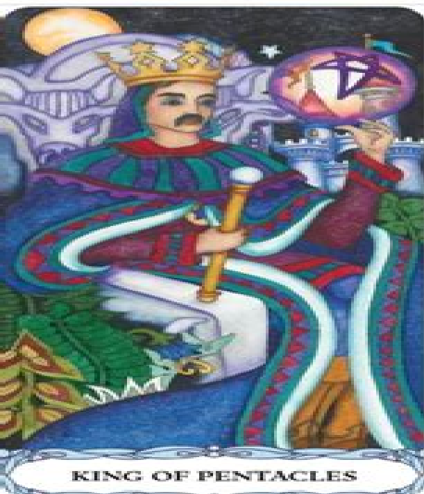
KING OF PENTACLES