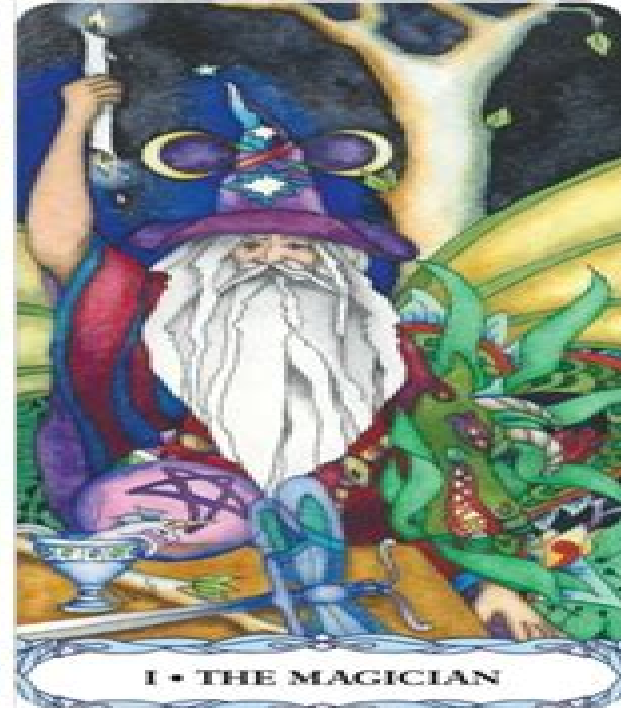
I • THE MAGICIAN