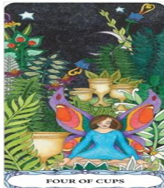
FOUR OF CUPS