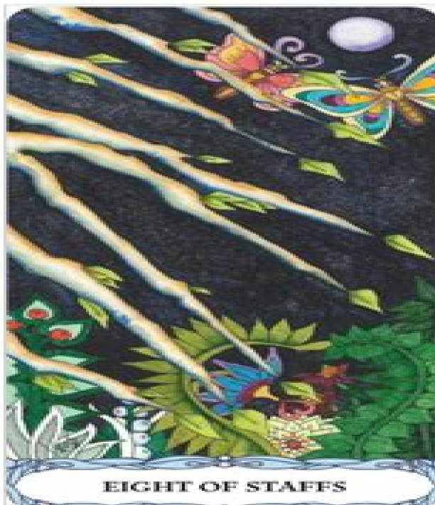
EIGHT OF STAFFS