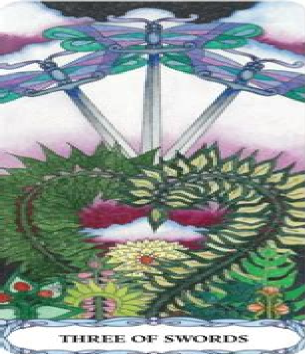
THREE OF SWORDS