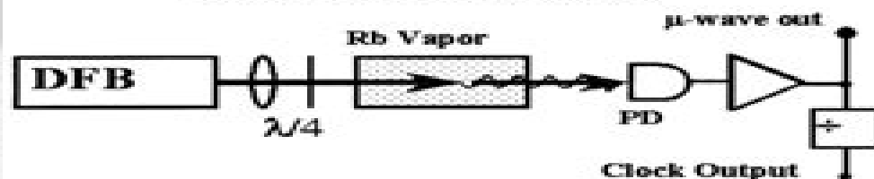
Diode Laser Atomic Clock