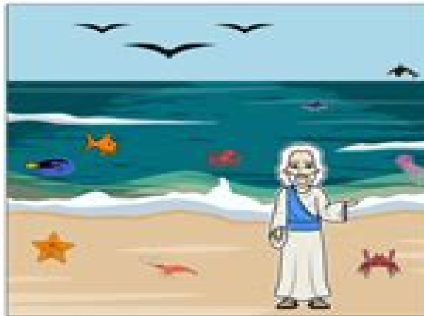
God created the birds and the fish -

Day 5 of creation: He then said, "Let the waters swarm with swarms of living creatures, and let birds fly above the earth across the vault of the sky." (Genesis 1:20) And it was so. God created the great sea-monsters, and creatures of every kind with which the waters swarm and wingedbirds of every kind.