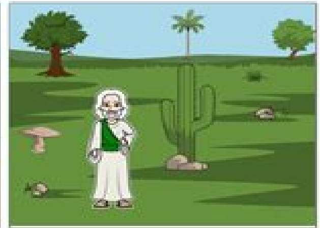
God created the land and the trees -

Day 3 of creation: Then God said, "Let the land produce seed-bearing plants and fruit-bearing trees of every kind." (Genesis 1:11)