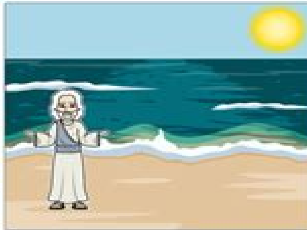
God created the sea and the sky -

Day 2 of creation: And God said, "Let there be a vault between the waters to separate water from water." So God made the vault and separated the water under the vault from the water above it. And it was so. God called the vault "sky." And there was evening, and there was morning—the second day. (Genesis 1:7-8)