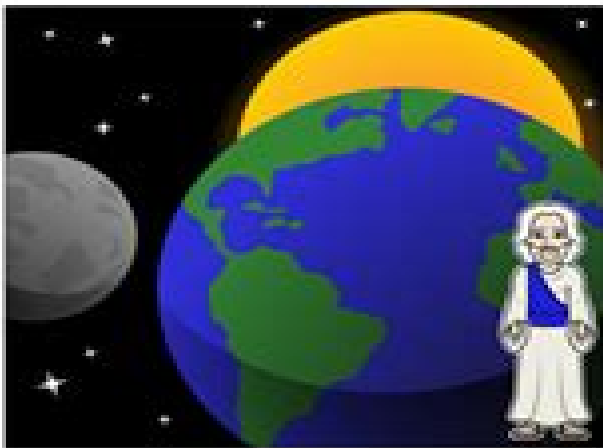
God created the sun, the moon, and the stars -

Day 4 of creation: And God said, "Let there be lights in the vault of the sky to separate the day from the night, and let them be signs to mark seasons, days and years." (Genesis 1:14-15) And it was so. God made the greater light to rule over the day, and God made the lesser light to rule the night, and the stars. (Genesis 1:16-17)