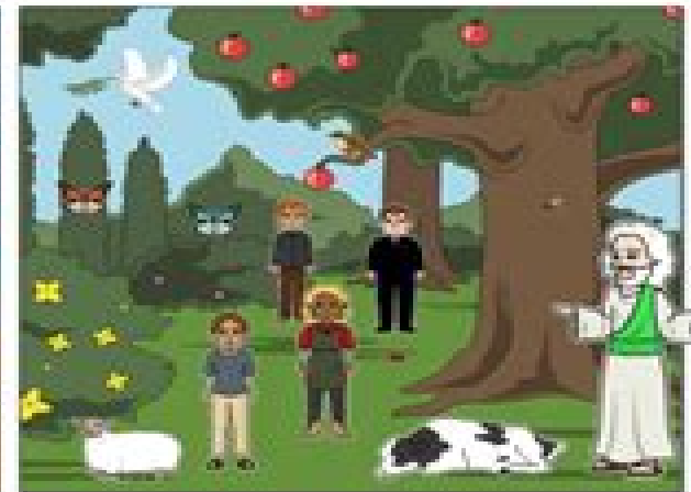
God created humans and animals -

Day 6 of creation: Let us make humans in our image, in our likeness. And let them rule over the fish of the sea and the birds of the air, the livestock and all the creatures, and all the creatures that creep along the ground. And God created humans in his image. In the image of God he created them, Male and Female, he created them. (Genesis 1:26-27)