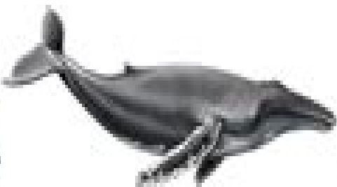
humpback whale ( Megaptera novaeangliae ) average length 14 m (46 ft)