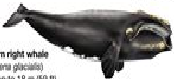
northern right whale ( Eubalaena glacialis ) length up to 18 m (59 ft)