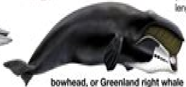
bowhead, or Greenland right whale ( Balaena mysticetus ) length up to 20 m (66 ft)