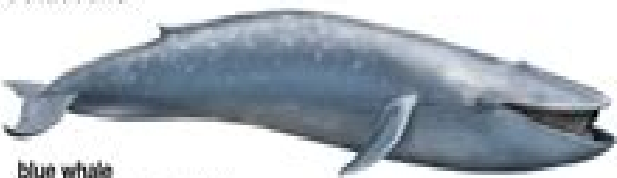
blue whale ( Balaenoptera musculus ) length up to 29.5 m (97 ft)