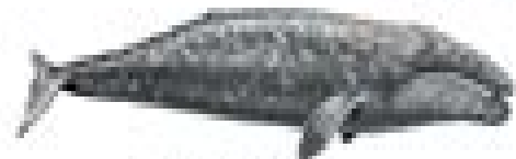
gray whale ( Eschrichtius robustus ) length up to 15 m (49 ft)