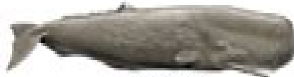
sperm whale ( Physeter macrocephalus ) length up to 24 m (79 ft)