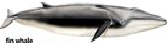
fin whale ( Balaenoptera physalus ) length up to 27 m (89 ft)