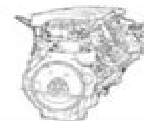
Fig. 1.24. General view of the engine Z 18 XEP

Also need the lift or support. Make sure that these devices have a margin of capacity and are able to raise the engine with all the mounted units. Safety measures play a crucial role, since the rise of the motor car - a potentially dangerous operation.