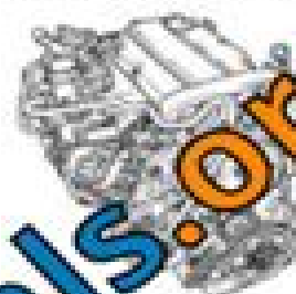
Fig. 1.22. General view of the engine Z 18 XEP

If it was decided to lift the engine, it is necessary to undertake certain