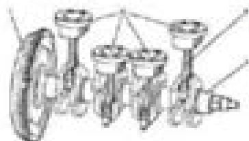
Fig. 1.18. Crankshaft and Pistons: 1 - Mainshaft, 2 - piston, 3 - connecting rod, 4 - Crankshaft

Crank mechanism is made more rigid without increasing weight.