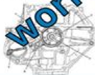
Fig. 1.21. Rear crankshaft oil seal with the sensor: 1 - rear crankshaft oil seal, 2 - encoder, 3 - Crankshaft, 4 - crankshaft sensor, 5 - connecting cable to plug the wiring harness of the crankshaft sensor

At petrol engine Z 18 XEP mounted on the rear crankshaft oil seal crankshaft.