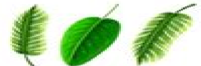
THREE TYPES OF LEAVES