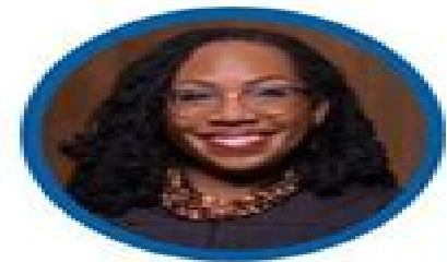
Ketanji Brown Jackson

Appointed by President Donald Trump in 2020