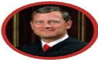
John G. Roberts, Jr. Chief Justice

Appointed by President George W. Bush in 2005