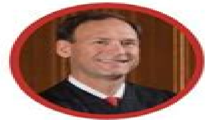
Samuel A. Alito, Jr. Appointed by President George W. Bush in 2006