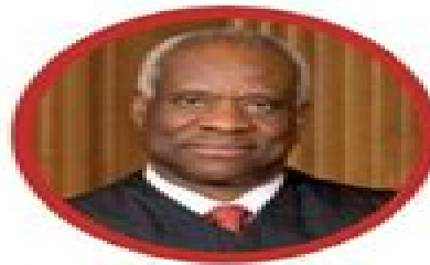
Clarence Thomas Appointed by President George H.W. Bush in 1991

Appointed by President George W. Bush in 2005