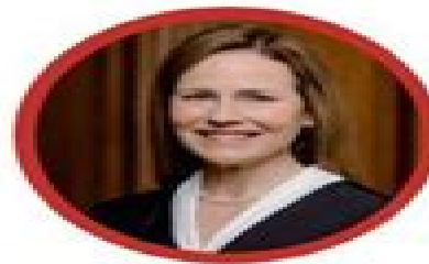
Amy Coney Barrett

Appointed by President Donald Trump in 2018