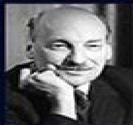
1945-1951 CLEMENT ATTLEE Labour