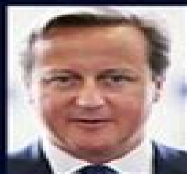
2010-2016 DAVID CAMERON Conservative