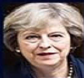
2016-2019 THERESA MAY Conservative