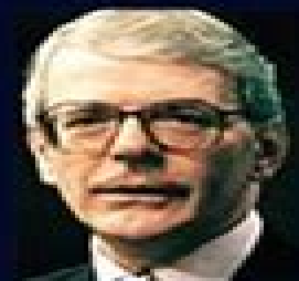
1990-1997 JOHN MAJOR Conservative