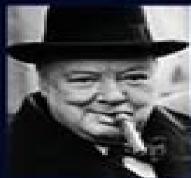
1951-1955 SIR WINSTON CHURCHILL Conservative