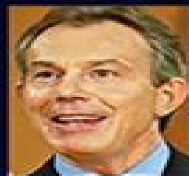
1997-2007 TONY BLAIR Labour