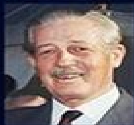
1957-1963 HAROLD MACMILLAN Conservative