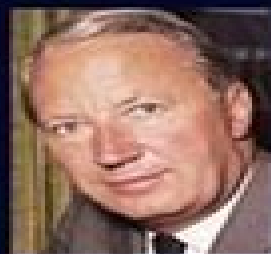
1970-1974 EDWARD HEATH Conservative