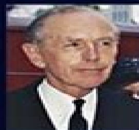
1963-1964 SIR ALEC DOUGLAS-HOME Con. (Scott Unionist)