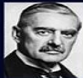
1937-1940 NEVILLE CHAMBERLAIN Conservative