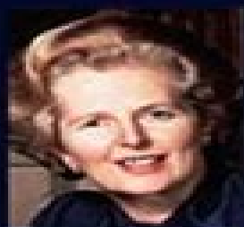
1979-1990 MARGARET THATCHER Conservative