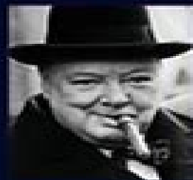
1940-1945 SIR WINSTON CHURCHILL Conservative