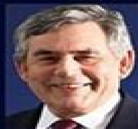
2007-2010 ORDON BROWN Labour