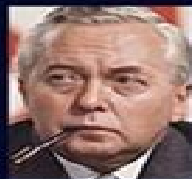
1964-1970 HAROLD WILSON Labour