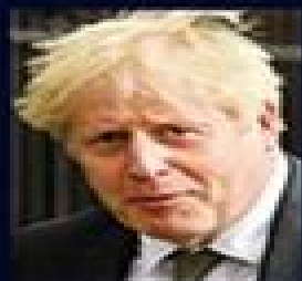
2019-2022 BORIS JOHNSON Conservative