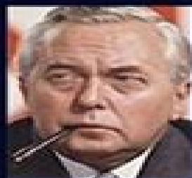
1974-1976 HAROLD WILSON Labour