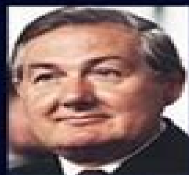
1976-1979 JAMES CALLAGHAN Labour