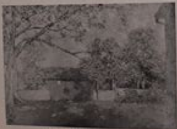
FIG. 25. BARN AT WYOMING, N. 1905