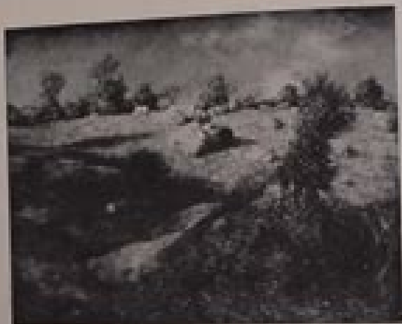
FIG. 24. THE UPLAND PASTURE. 1905