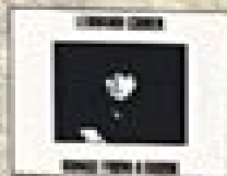
SONGS FROM A ROOM