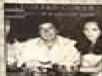
DEATH OF A LADIES MAN