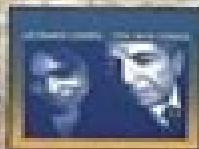
TEN NEW SONGS