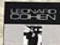
I'M YOUR MAN