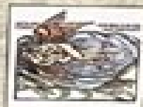
NEW SKIN FOR THE OLD CEREMONY