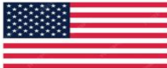
Governmental Color Specification