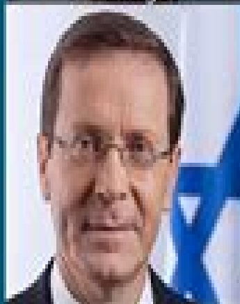
President Isaac Herzog