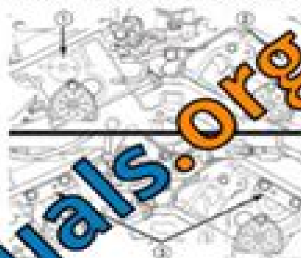
Fig. 77 Crankshaft Alignment Special Tools (SAAT)