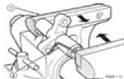
Fig. 78 Compressing Timing Belt Tensioner