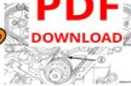
Fig. 77 Crankshaft Sprocket Timing Marks

(5) Install the timing belt starting at the crankshaft sprocket going in a counterclockwise direction (Fig. 76). Install the belt around the last sprocket. Make sure tension on the belt as it is positioned around the tensioner pulley. Each crankshaft sprocket mark should still fall between the outer marks.