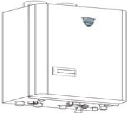
For possible water heating and space heating