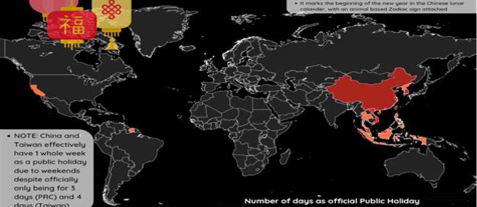
Number of days as official Public Holiday

• NOTE: China and Taiwan effectively have 1 whole week as a public holiday due to weekends despite officially only being for 3 days (PRC) and 4 days (Taiwan)