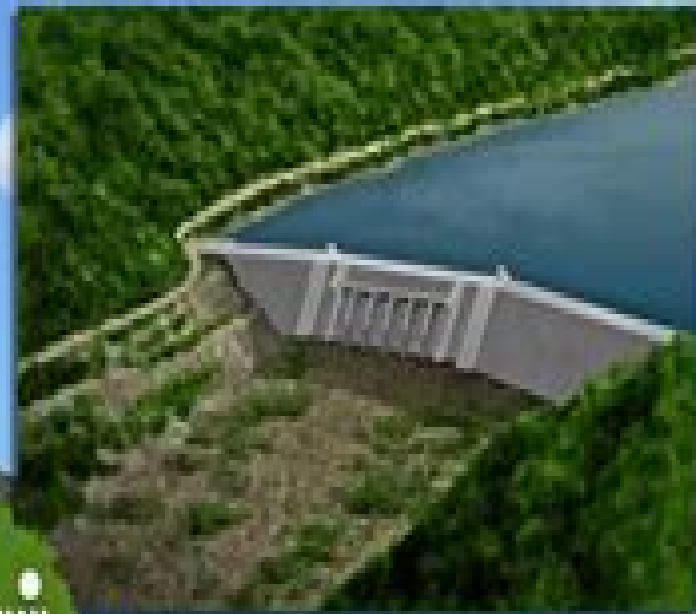
BURDEKIN FALLS DAM