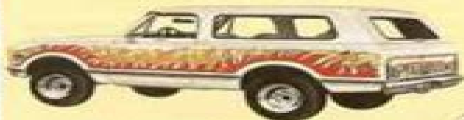
"Flame"—available on Blazer, Fleetside Pickup (without the 400 paint and upper molding) or Suburban.