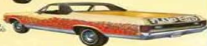
"El Camino Flame"—available on El Camino.

*Rear nameplate decal not available with this decal set.