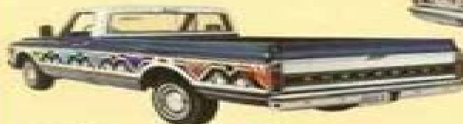
"Hawk"—available on Fleetside Pickup (including those with upper and lower moldings).