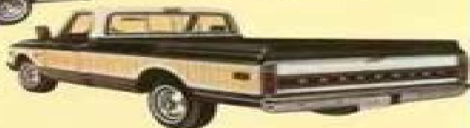
"Wheels"—available on Fleetside Pickup (including those with upper and lower moldings).