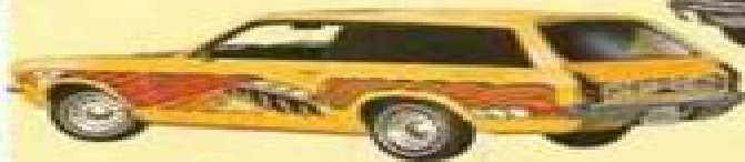
"Little Eagle"—available on all Vega models.