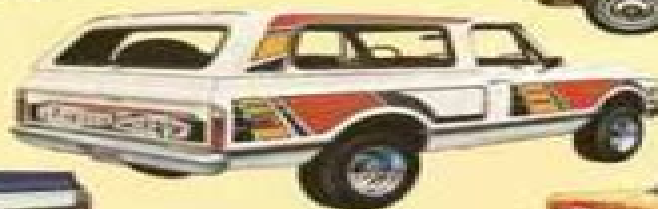
"Feathers"—available on Blazer, Fleetside Pickup (without the 400 paint and upper molding) or Suburban.