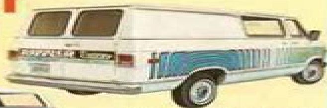
"Rippler"—available on Chevy Vans and Sport Vans.