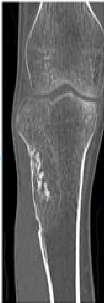
Bone regeneration therapy