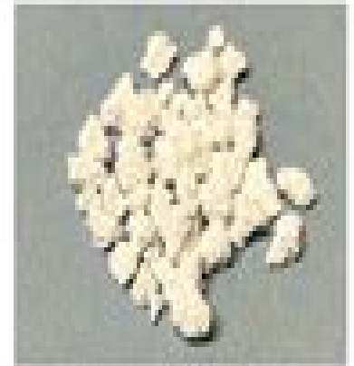
Calcium phosphate bioceramics