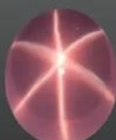
Star Rose Quartz