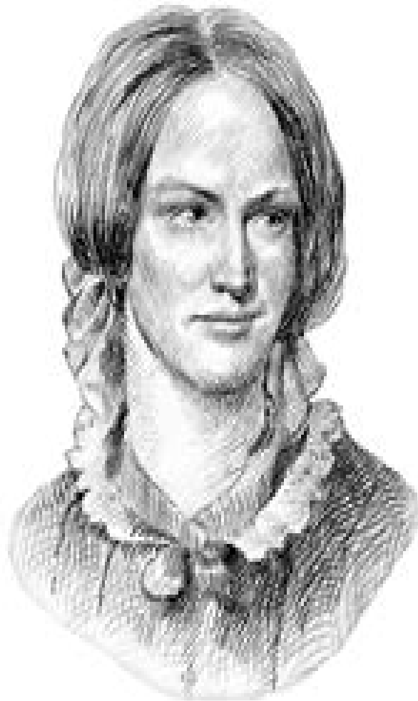
Charlotte Jane Eyre