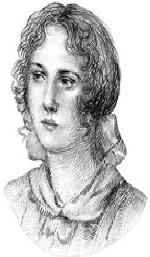
Anne The Tenant of Wildfell Hall