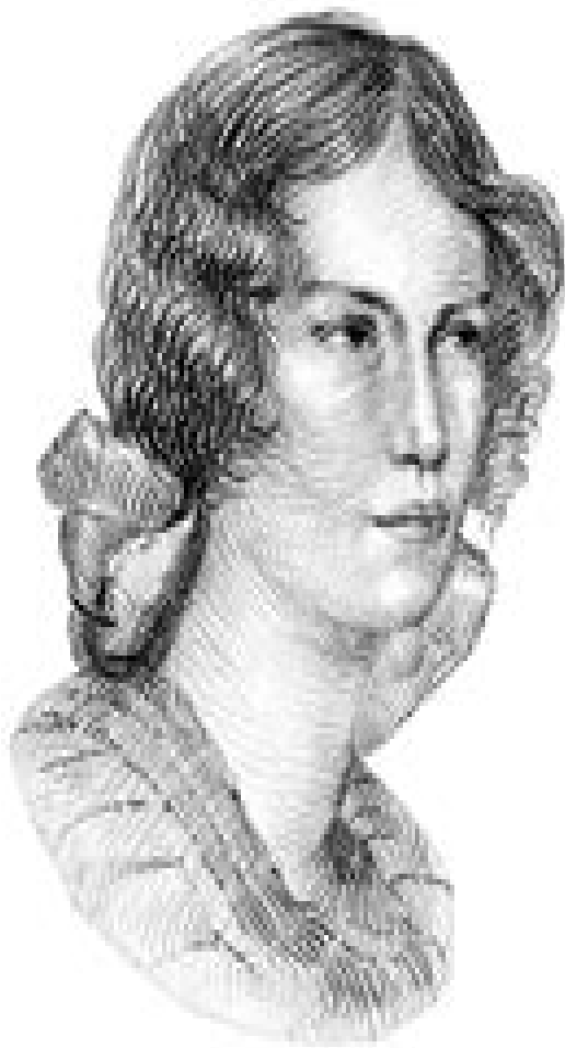
Emily Wuthering Heights