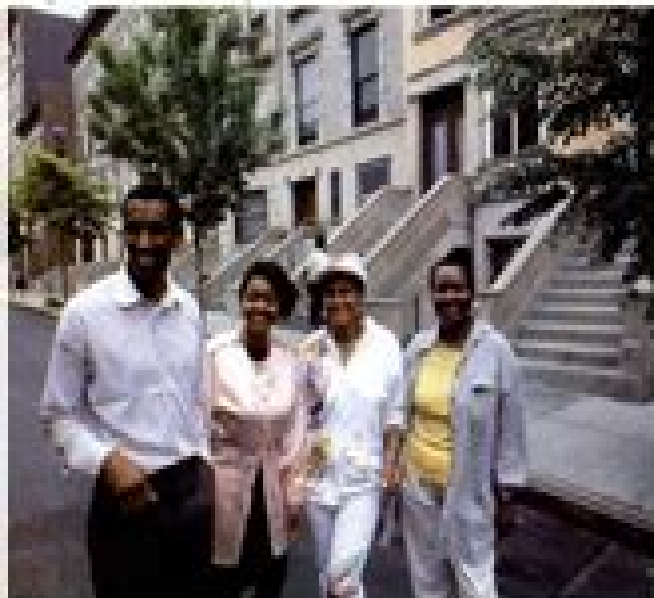
HAMILTON HEIGHTS New York City

Quiet, well-cared-for communities attract those who have 'made it'