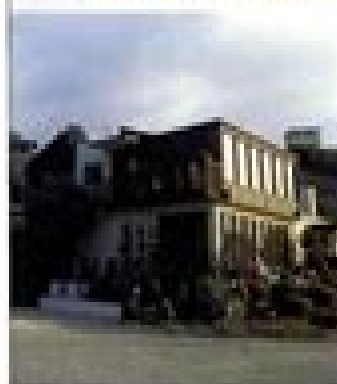
A primarily 10 minutes away from downtown Los Angeles, Balwyn Hills has the charm of sprawling beauty and well-maintained homes. In right Balwyn Hills residents have and have friends who at home this is an 1984 marketing representative and she is an administrative assistant at 1984.