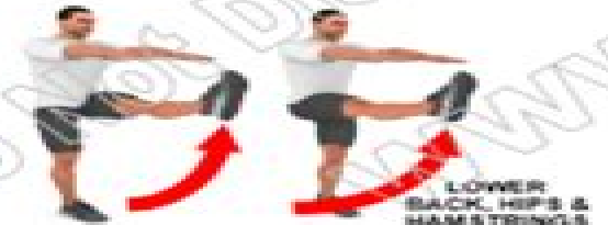
LOWER BACK, HIPS & HAMSTRINGS