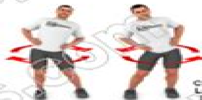
CORE & LOWER BACK