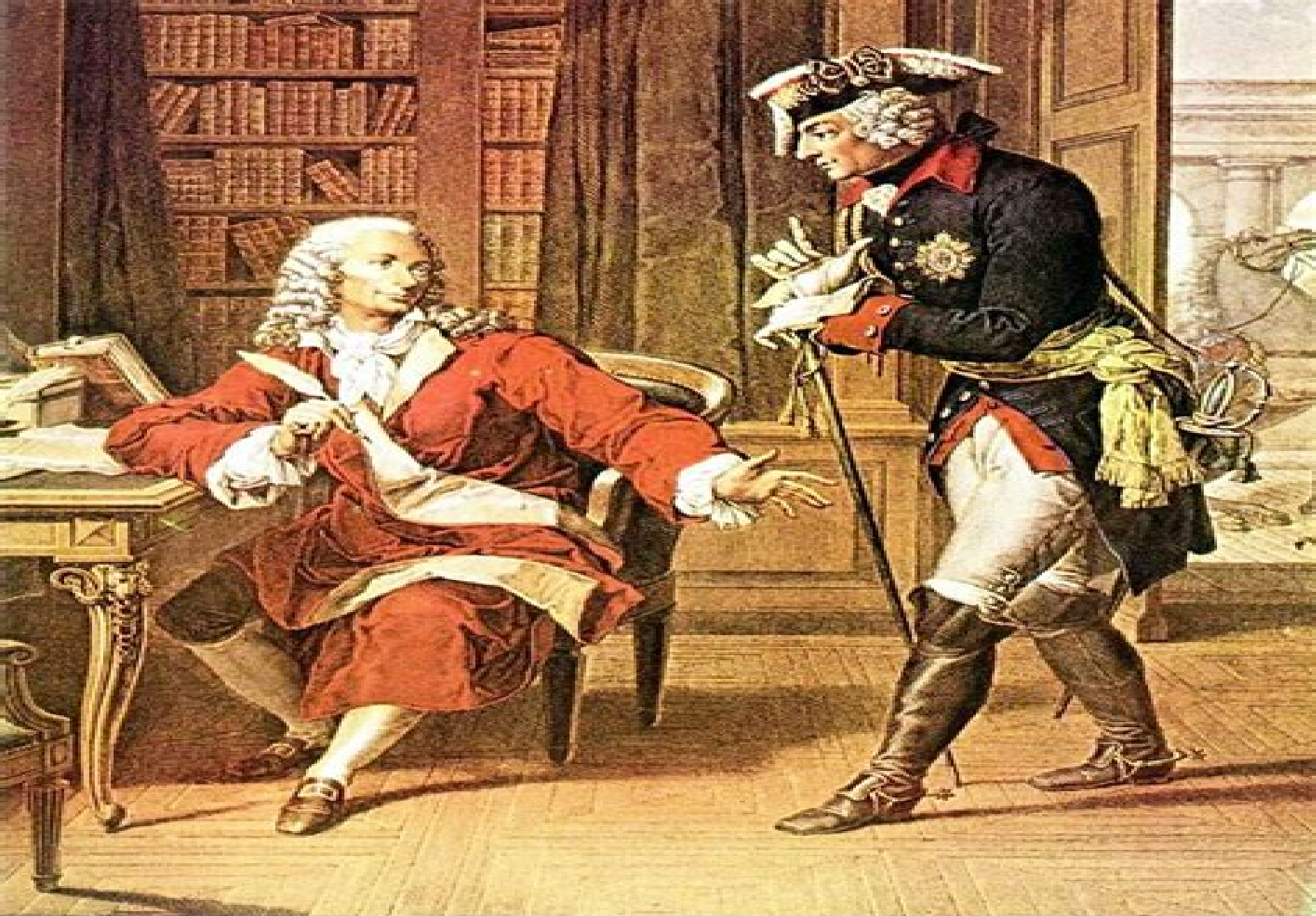
Voltaire et Frédéric II