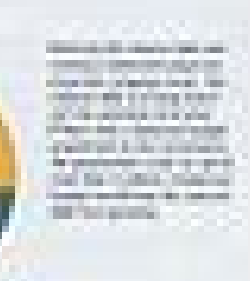
The Legislative branch is divided into the House of Representatives and the Senate.

The Legislative branch is the branch of the government that is responsible for making the laws. It is made up of two parts: the House of Representatives and the Senate. The House of Representatives is made up of members from each state, and the Senate is made up of two members from each state. The Legislative branch has the power to pass laws, and to approve or reject the President's appointments.